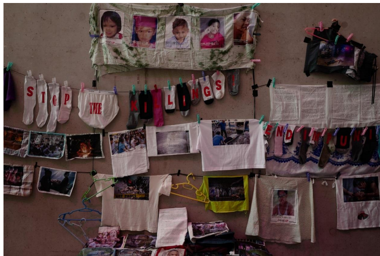
Figure 1. Nanlaba(n) exhibit during the Tao Po performance at the Crea Theater, Amsterdam (October 2019).

Nanlaban , meanwhile, refers to the police's assertion that deaths classified as drug-war-related are due to legitimate encounters when suspects allegedly fought back against cops during antidrug operations,