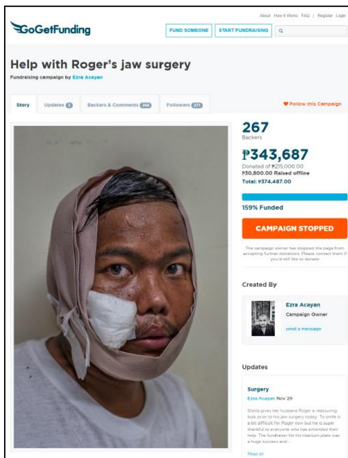
Figure 4. The crowdfunding page for Roger Herrero, exceeding by almost 60% its funding goal (November 29, 2018).