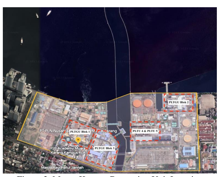
Figure 2. Muara Karang Generation Unit Location

In this study, the public health and externality costs were calculate based on the power plants operating in the Muara Karang Generation Unit, namely PLTGU, with and istalled capacity of each Block 1,2,3, is 404 MW, 680 MW, 495 MW, and also two unist of PLTU 4 and PLTU 5 with a total installed capacity of 400 MW. By knowing the installed capacity of each power plant and its operating time, the electricity production is 3539040 MWh/year for PLTGU Block 1, Block 2 is 5956800 MWh/year, and PLTGU Block 3 is 4336200 MWh/year. Electricity production for PLTU Unit 4 and Unit 5 is 1752000 MWh/year, respectively. Based on the data above, the result of calculating the public health impact for each power plant in the Muara Karang Generation Unit is below.