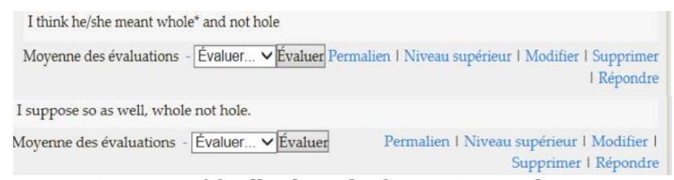
Fig. 4. Peers' feedback on the first writing task

As made clear in the figure below (see figure 4), students took their time reading the first participation by EFL 25, then some of them reacted by providing their own comments. Student one (EFL 11), showed a high level of positive thinking and care for his peers by responding to the spelling issue raised by the teacher: "I think she/he meant whole not hole." For the researcher, the fact that EFL 11 used both pronouns "she/he" proved anonymity of the task and gave his peers more confidence in taking part in the task. Later, another student (EFL 02) added a comment in the same respect "I suppose so as well, whole not hole." (Figure 4).