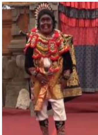
Figure 2. Tugek character in a prembon performance