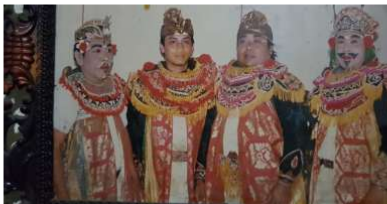
Figure 3. Sekaa (group) of Tugek Carangsari

Based on this statement, the performance of Tugek character is not only performing an entertaining presentation, but also educating, guiding, providing a reflection, and being a role model to the community, especially for the younger generation of women. Tugek is one of the female characters in the Balinese petopengan who has a role as a servant or assistant in a palace or kingdom in Bali. Tugek character itself has a bad appearance with a shy character but has good intelligence, and always follows the orders of his own mother or pussy.