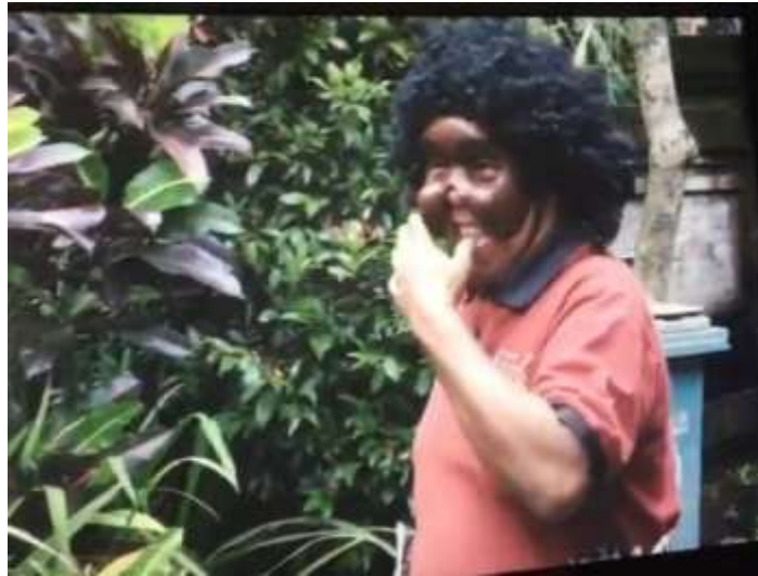
Figure 4. Tugek character is doing one of his movements

Tugek character immediately rushed to ask permission to go back to Puri, then walked back to the backstage (lanse) with a metayungan movement, and biting one thumb and oyod-oyod while walking backstage singing and saying pole goodbye.