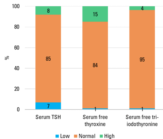
FIGURE 1 Thyroid function abnormalities in the study participants (n=

Considering the laboratory cut-off values, 7 (8.0%), 13 (14.9%), and 3 (3.4%) had high and 6 (6.9%), 1 (1.1%), and 1 (1.1%) had low serum TSH, FT 4 , and FT 3 values, respectively in the study participants ( FIGURE 1 ). Other participants had normal TSH, FT 4 , or FT 3 levels. A total of 62 (71.3%) of the study participants had euthyroid status ( FIGURE 2 ).