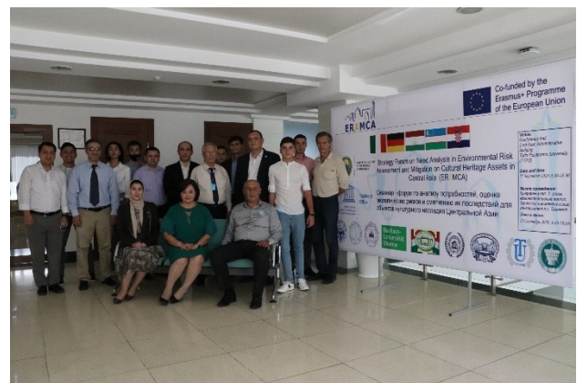
Figure 1. Participants in the Strategic Forum of the ERAMCA project (Tashkent, September 2020)

During a workshop, the invited experts presented the current situation in respective Countries regarding risk assessment and mitigation. They pointed out the need for a new generation of technicians (engineers and architects) to work in a multidisciplinary context by merging different expertise.