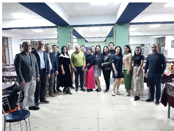
Figure 6. Teachers and students of the Eramca Master in Turin Polytechnic University of Tashkent

In 2022, all four Central Asia Universities submitted the study plan of the ERAMCA Master to local authorities to obtain the "licence" to activate the course and to deliver, in the end, the official degree recognised in the respective Countries. Once the licenses had been obtained, the four involved Central Asia Universities started recruiting potential students and a strong selection among the candidates.