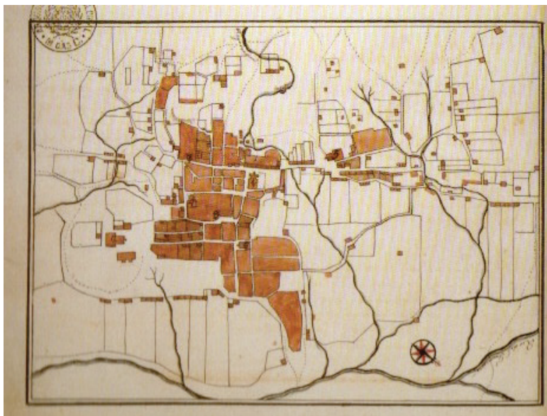
Figure 2 – Legenda da Pequena Planta do Arraial do Tejuco.