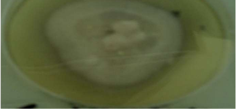
Figure 1. T.verrucosum colony on SDA

T. rubrum: after 7-10 days of incubation at 25^{\circ} C on SDA, colonies appeared as fluffy wool smooth in texture, white-creamy while the back of the plate was brown(Figure.3) When staining by cotton lactophenol cotton blue showed large elongated conidia like tear with divided long hyphae.