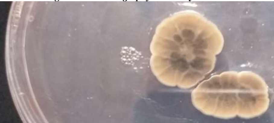
Figure 3. T. rubrum on SDA