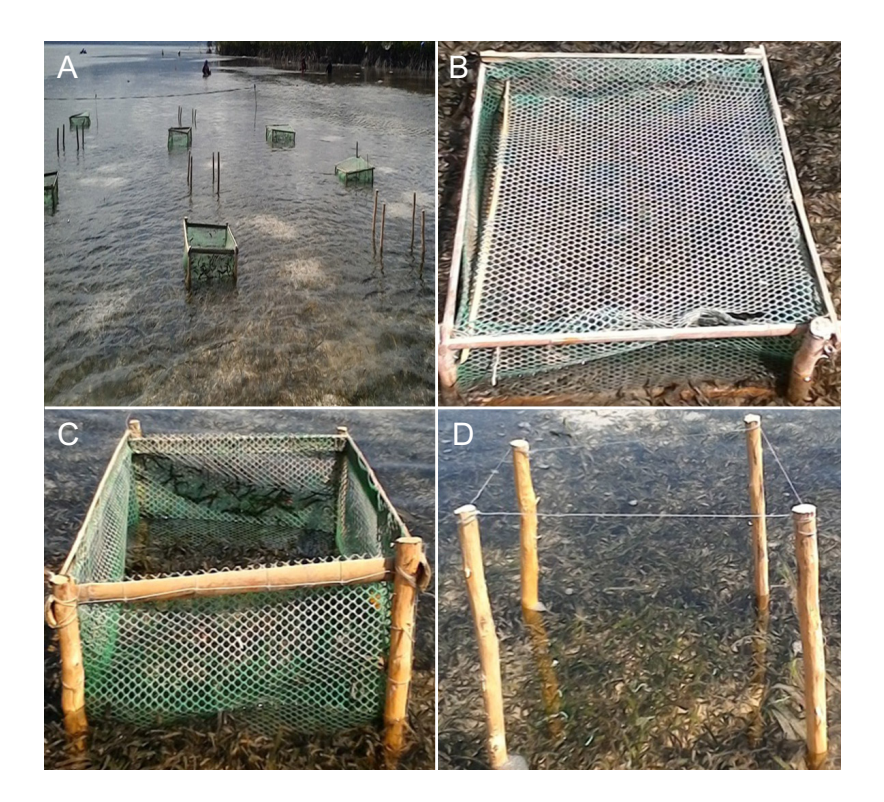
Figure 2. Different caging treatments in the study site (A), full cage (B), partial cage (C), and open cage (D).

hemprichii in the full cage, partial cage, and open cage, respectively. Initial shoot counts for T. hemprichii were determined during the first sampling, and final cover was counted during the last sampling. These data were later used to compare different treatments in terms of the number of shoots, but no attempt to statistically compare the data was done because of the sparse number of unit observations. Tagged individual shoots of T. hemprichii in each treatment were measured repeatedly during the weekly monitoring to the study site. Initial and final shoot length measurements were noted and compared in all treatments. Seagrass counting and measurement of shoots were done during the low tide period. During data collection, observations on the abundance and density of rabbitfish and other fish species found in the sampling site were performed during high tide using FVC. On the other hand, counting and measuring of leaf shoots happened during low