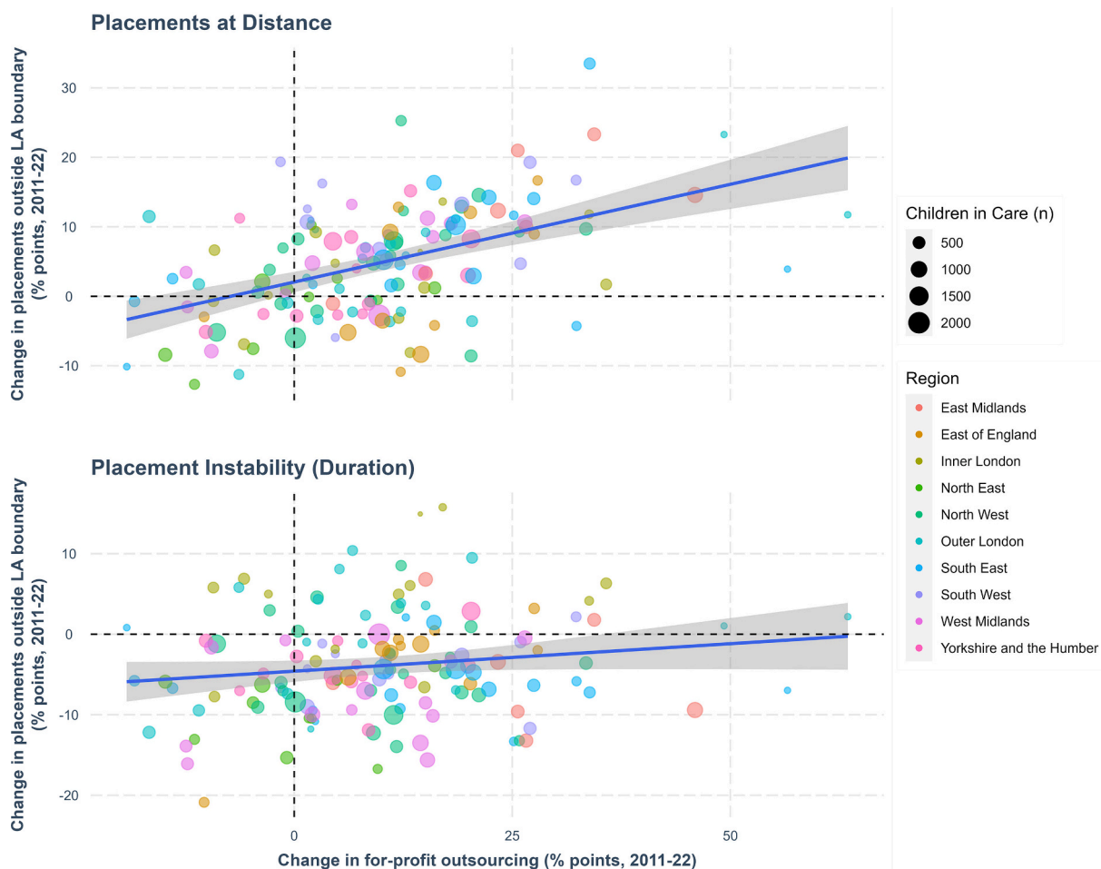
Fig. 2. Association between changes in for-profit outsourcing and changes to placement outcome.

Fig. 1 shows that there is large variation in the proportion of out-of-area placements across local authorities (LAs). Some LAs place almost all children within their boundary, whereas others place all or most children in other LAs. Panel B of Fig. 1 shows that rural LAs have the fewest children placed outside their boundary. Panel C shows that the issue of placing children within the responsible LA is