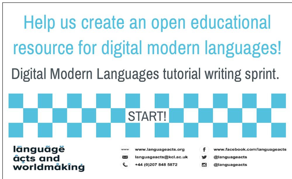
Figure 1: Call for proposals for a Digital Modern Languages tutorial writing sprint in July 2019. https://www.kcl.ac.uk/news/call-for-proposals-for-a-digital-modern-languages-tutorial-writing-sprint-in-july-2019 .

The call for proposals asked prospective authors for general metadata about their proposal, as well as the tutorial's aims, proposed structure, scope/focus, educational level (primary,