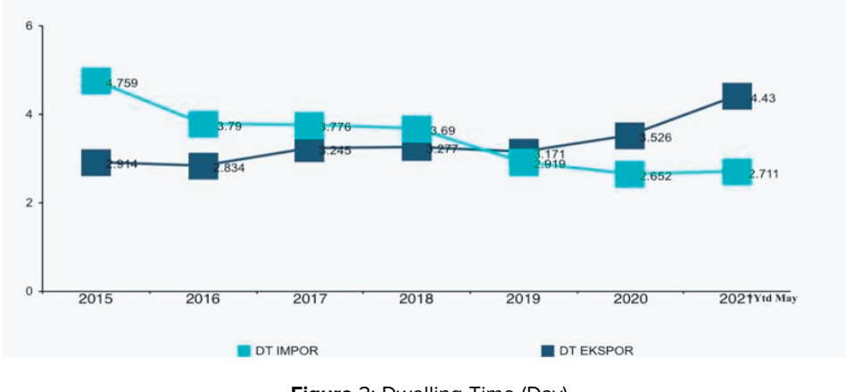
Figure 3: Dwelling Time (Day).

operations had issues above 4 days, because the vessel arriving was late. But import operations were unaffected and achieve the target because the needed time was just 2.7 days.