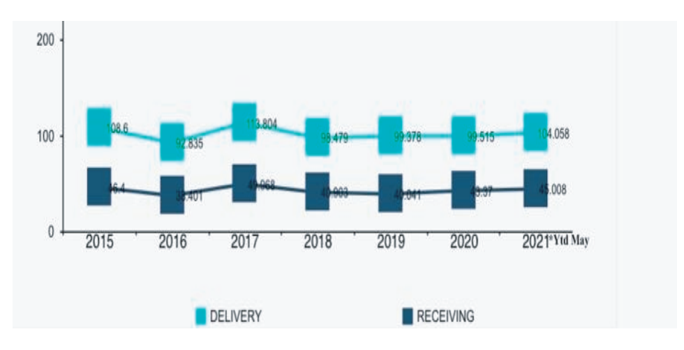
Figure 2: External Truck Round Time (Minute).

The X line shows total container accomplishments, whereas the Y line indicates year accomplishments. The total number of containers received and sent each year is represented by TRT (Truck Round Time). The graph below shows TRT at TPK Koja in 2021 from January to May. TPK Koja received 104,058 TEUS, with 45,008 TEUS being shipped.