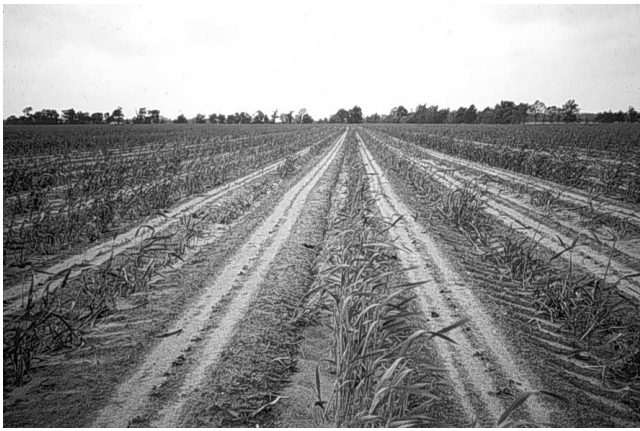
Figure 2. A small grain used as a cover crop for cotton can be planted solid or in furrows.

disturbance of the soil during field preparation and planting are proven techniques for controlling wind erosion.