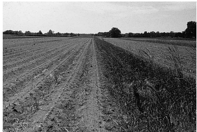
Figure 1. Barrier strips of tall vegetation can reduce wind erosion and related damage to a cotton crop.

The large tree and shrub windbreaks that have been a part of the solution for southeast Missouri cotton producers are being removed and are not being replaced. This change is due to the introduction of center-pivot irrigation, expansion of the area needed to maneuver large agricultural implements, the cost of