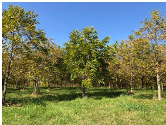
Green, anthracnose resistant tree (center) surrounded by yellowing, partially defoliated anthracnose susceptible trees in late summer.

see bottom right image). Timing of this application is critical, so cultivar differences in flowering date must be considered. The earliest flowering trees may require a second fungicide application 10 to 14 days after the first spray. During an unusually wet spring, additional fungicide applications may also be necessary.