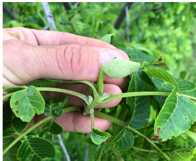
Pistillate flowers are pollinated when the ovule begins to swell, and the stigmas turn brown/black. Fungicides for season-long anthracnose control may be applied at this stage.