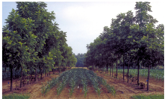
Black walnut and corn alley cropping

For ideas on marketing and guidelines for budgeting a black walnut orchard, contact the UMCA at blackwalnut@missouri.edu . The UMCA offers additional information on marketing specialty crops and has designed an Agroforestry Black Walnut Financial Model to assist with decisions including tree spacing, nut harvest and whether to use improved (grafted) or unimproved trees. This convenient spreadsheet tool will help make estimates about future nut production and tree diameters. Visit centerforagroforestry.org to access more information.