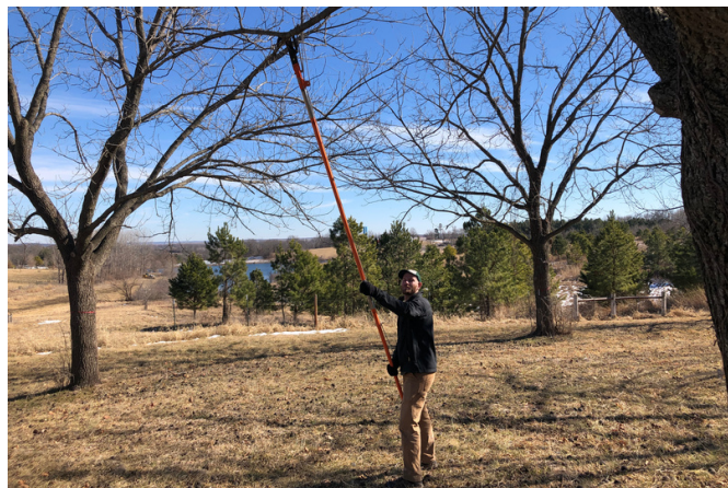
An extendable pole saw, or pole pruner may be used to remove low-hanging, water sprouts, broken, weak, or diseased branches during dormant winter pruning in a mature black walnut orchard.

Pruning Mature Trees Pruning should be done during winter while the trees are dormant. Dormant winter pruning will promote new growth, while summer pruning will inhibit growth. Careful pruning during the establishment of the orchard will lead to the development of desirable canopy structure of the trees, while pruning at bearing age will help maintain that structure and promote nut production (see right image). Pruning bearing trees can also help to facilitate mechanical harvest. Prune mature trees to remove low hanging, broken, weak, or diseased branches, as well as eliminate any water sprouts. Remove branches that are crossing or rubbing together. Every time you prune walnut trees (dormant or summer pruning), look to correct tree structural problems. If a branch has formed a narrow crotch at the point of connection with the trunk, remove the entire branch to eliminate future problems with limb breakage. The goal is to promote two or three well-spaced lateral branches that are oriented evenly around the trunk and staggered with respect to those below them to create a well-balanced crown. Avoid cutting branches that are greater in size than one-third of the main trunk. It is not recommended to paint cut wounds.