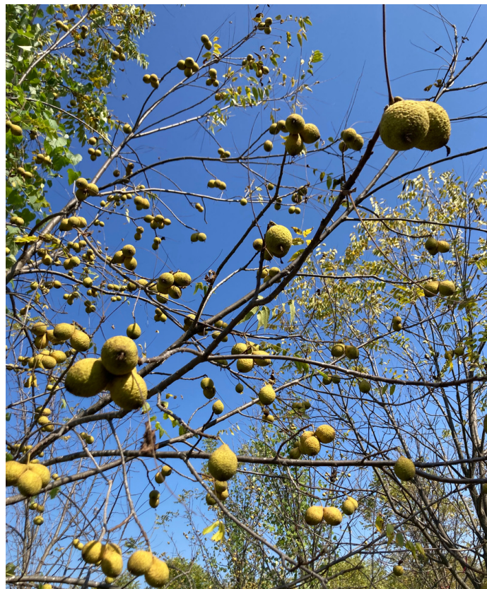
Nuts maturing on the limb of a black walnut tree