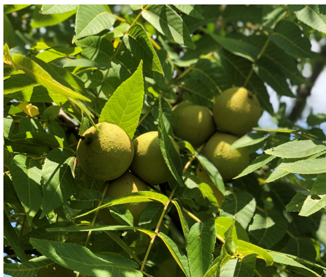
Nut clusters on a mature black walnut tree

trees can be maintained using herbicides and/or the application of wood chip mulch. Do not use hay or grass clippings to mulch your trees, as these types of "soft" mulches can provide an excellent shelter for tree-gnawing rodents. Planting a cool season perennial, low-growing grass that can tolerate frequent mowing is recommended to conserve moisture between tree rows.