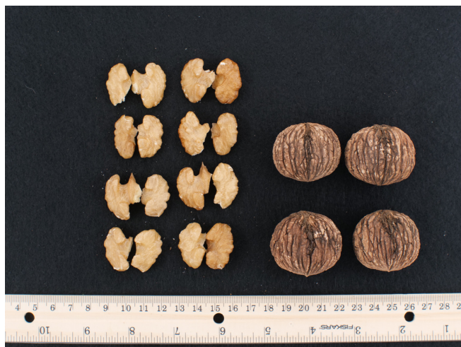
Black walnut nut meat and shells

Reid, W., M.V. Coggeshall, and K.L. Hunt. 2005. Black walnut cultivars for nut production. Walnut Council Bulletin 32(3):1,3,5,12,15. Schlesinger, R.T., and D.T. Funk. Managers Handbook for Black Walnut. USDA Forest Service. http://nrs.fs.fed.us/pubs/103