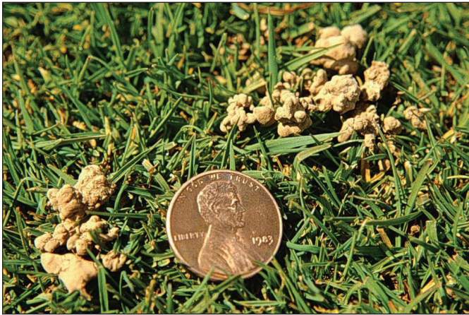
Figure 3. An excellent indicator of a healthy soil is the presence of earthworms or earthworm castings.

Applying carbohydrates and proteins, ingredients usually not included in many synthetic fertilizers, is part of a “feed the soil” philosophy. Maintaining a balanced, healthy soil system ensures that the essential nutrients we apply are used efficiently (Figure 3).