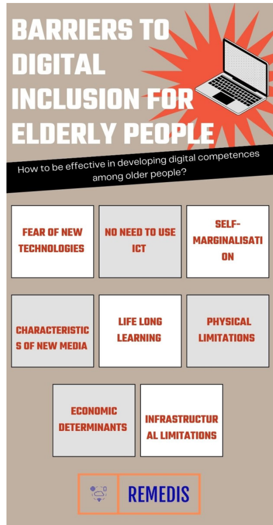
FIGURE 2. Overview of the barriers to digital competence among older people

A factor associated with handling new media concerns the perceived dangers present in cyberspace. The respondents suggest that there is a group of older people who are very fearful of handling e-services due to a perception of the prevalence of online fraud or phishing attempts. This kind of fear can be understood in two ways. On the one hand, it demonstrates an awareness of the features of the information society, while on the other hand, it represents a fear resulting from an inadequate level of digital competences that includes not only elementary ICT skills but also a digital security component.