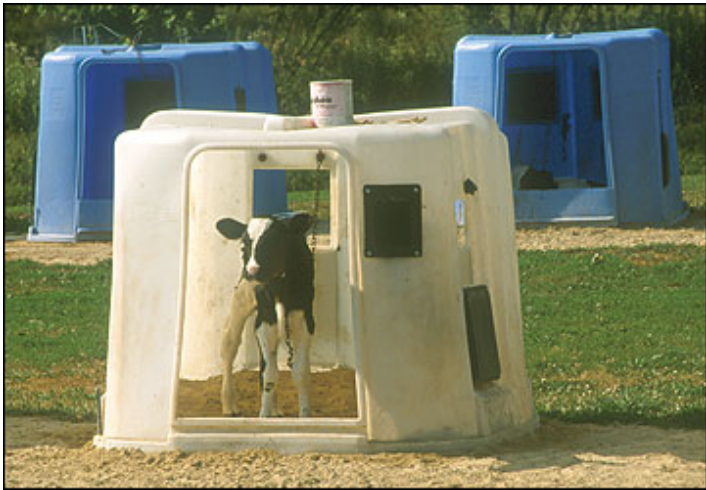
Figure 2. Individual calf hutches enable producers to concentrate calving of large groups of heifers.

At least 34 to 45 square feet of clean, dry bedding should be available per calf. The ventilation system should allow for at least four air exchanges per hour.