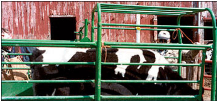
Figure 5. Weighing heifers at critical stages of development enables producers to gauge the effectiveness of their management program.

However, many grazing operations elect to have other producers custom-raise their heifers to maximize the land available for lactating cows. This allows the producer to focus on the milk/dry cow programs and the grazing system while a custom grower manages the heifer enterprise. Other producers have the land available or do not elect to “farm out” their heifers because they do not wish to expand cow numbers. Smaller grazing systems can be designed for these heifers, which can be used in the lactating herd system to manage surplus forage in a put-and-take method. Still other producers have opted to sell all baby calves, heifers and bulls, and purchase replacements, as needed. These producers play the game of price fluctuations and the difficulty of purchasing the type of cattle they desire at a reasonable price. Another consideration in buying any or all replacements is the potential for bringing diseases or health problems such as Johne’s disease, BLV or mastitis into the herd. Preferably, these producers should purchase animals from known sources where the milk production, somatic cell count (SCC) and health status of the animals are known. However, these types of animals are not always available.