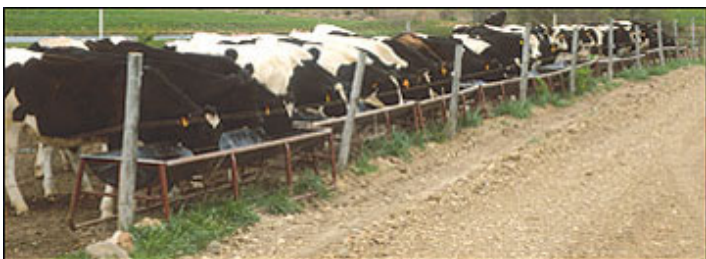
Figure 6. Heifers are capable of gaining 1.75 pounds a day with a well-managed MIG system that included supplementation.