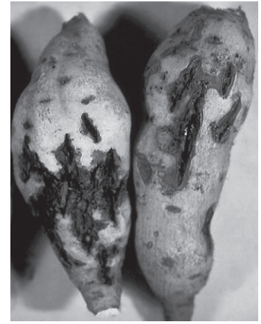
Society of Nematologists slide set