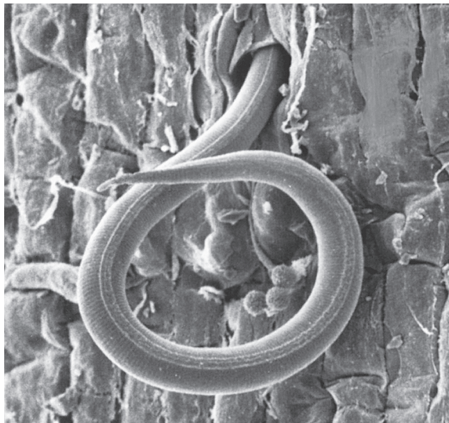
Figure 1. Juvenile of root-knot nematode (endoparasite) penetrating a tomato root. Magnified 1,800 times.

Soil usually contains many free-living, or non-plant-parasitic, as well as plant-parasitic nematodes. Often, several genera of plant parasites are present in the same