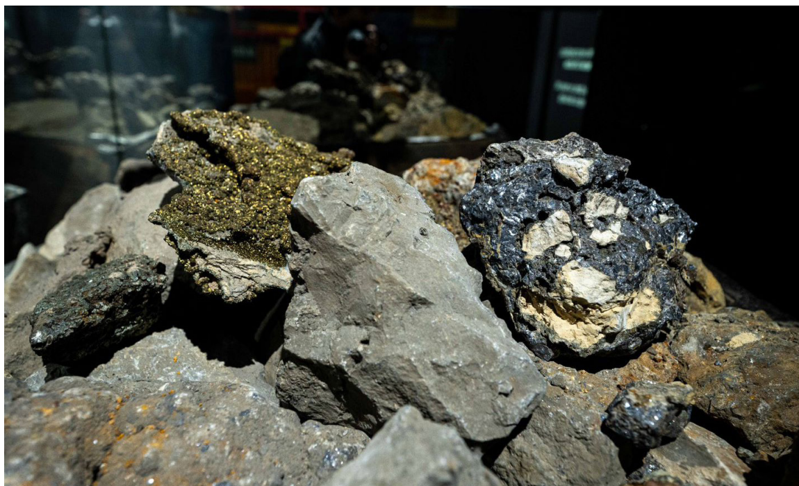
^ Fig. 2 Zinc and lead ore, Museum of Zink, Bukowno (Source: Daniel Sztork, 2022).