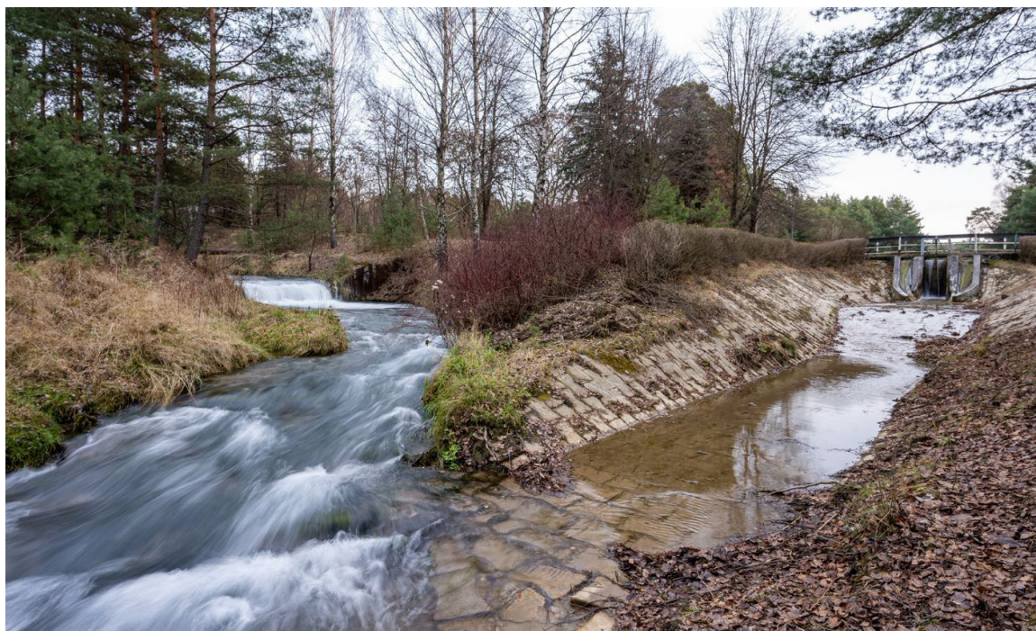
^ Fig. 3 The mining waters (on the left) enter Sztola's riverbed in December.