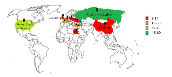
Figure 1. Worldwide (top ten countries) production of sugar beet; numbers indicate million tons. Source: [19].