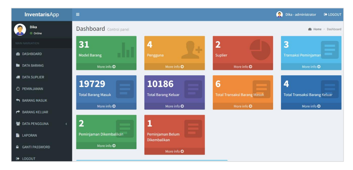
Figure 3: Main page Dashboard of Inventory App.

This application consists of 2 access rights, namely Admin and Operator access rights. The difference is that the admin can access all data in the inventory application. However, Operator can only access information on goods data, suppliers, loan data, incoming and outgoing goods data. Admins and Operators are required to login first to access the inventory application. In the inventory application there is a main page, namely the dashboard. It consists of information summary regarding detailed user login information, number of item models, number of suppliers, number of users, number of loan transactions, number of incoming goods, total outgoing goods, total incoming goods transactions, total outgoing goods transactions, total loan disbursement and the total loan has not been returned. The main page of the inventory application Dashboard can be seen in Figure 3.