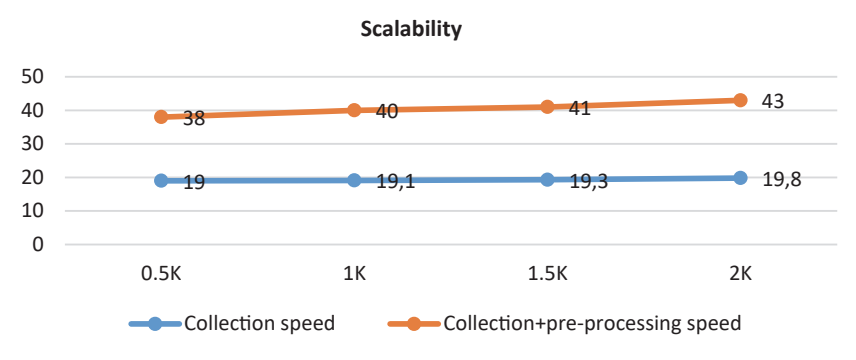
Figure 4. The scalability results of the proposed system