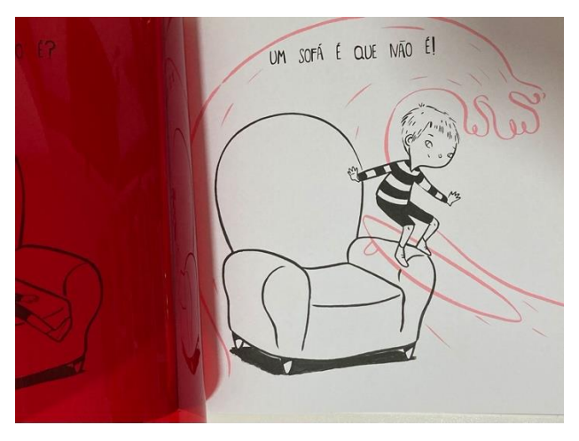
Figure 9. Unveiled image after turning the acetate page.

Navas, D. (2023). Multimodal narratives in contemporary Brazilian children's literature. Child Studies, (2), 55-68. <u>https://doi.org/10.21814/childstudies.4526</u>