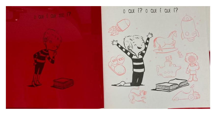
Figure 10. The final set of double pages with the representation of the book.

A closer reading of O que é que isso é? may even suggest a metalinguistic bias. At the end, in the last set of double pages, we have: "What is that?", followed by a phrase that breaks the established syntactic pattern: "What is it? What is it? What is it?" The object we now see is a book, which remains even when the acetate page is turned and appears accompanied by the illustrations that permeate the entire work (Figure 10), thus suggesting the space of the book as being open to fantasy and imagination, the space that makes it possible to create and break with the automation of our gaze faced with everyday elements.