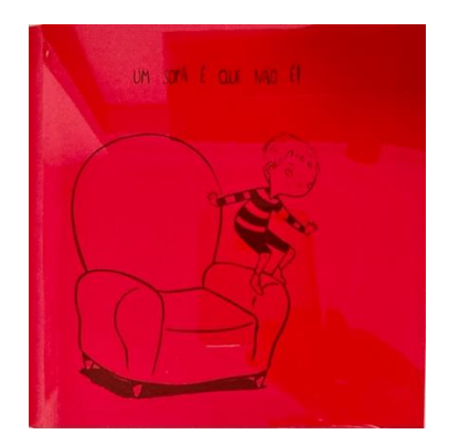
Figure 8. Illustration visualised when superimposed on the acetate sheet.

However, our attention is drawn to a red acetate sheet between the two pages, which is present on the cover. This material element is responsible for the game established in the narrative, guaranteeing its playful character. This is because, when we visualise the page on the right superimposed with the acetate, there seems to be a contradiction concerning the verbal text (Figure 8). If the verbal text states: "What is that?/It's not an armchair", it is precisely the image of an armchair that we come across when we look at the page superimposed by the acetate sheet.