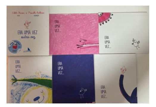
Figure 5. Glove and pages that makeup Era uma vez outra vez .

While in Era Uma Vez Outra Vez [ Once upon a time again ], the title suggests a repetition of traditional stories, this conception is immediately challenged when we consider the book's materiality. The work is a kind of game book, which presents an illustrated poem, offered across five sheets, printed on offset paper (180 g/m<sup>2</sup>), and wrapped in a sleeve (Figure 5). Its pages are loose and folded in an accordion format, each side of the leaf corresponding to a stanza of the poem.