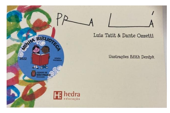
Figure 1. Cover of the book Pra lá .

Initially, attention is drawn to the horizontal format of the book (26 x 13 cm), which is closely in line with the title "Pra lá". This expression, which suggests a space far from the speaker, the idea of moving forward, gains materiality through the book's format, which, unlike traditional works, expands horizontally. Furthermore, the typography adopted in writing the title contributes to this idea of expansion and movement, as it expands in a concretely way due to the spacing between the letters (Figure 1).