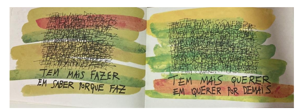
Figure 3. Illustrations constructed from overlapping phrases.

The content of the song points us towards the unknown. It invites us to think about what exists beyond what we see: "Tem carnaval muito além do cordão/Pra lá desse mundo, tem mais do que um rancho fundo/Tem mais fazer em saber porque faz/Tem mais querer em querer por demais" [There is carnival far beyond the rope/Beyond this world, there is more than a deep ranch/There is more to do in knowing why you do it/There is more to want in wanting too much] (Tati, Ozzetti & Derdyk, 2012 n.p). This suggestion of vagueness is in dialogue with the colour illustrations, which also show features that are not clearly defined. They merge, as seen in Figure 2, species of circles, and coloured spirals, which can point to the idea of turning movement. At times, the phrases themselves, overwritten, assume the function of illustration (Figure 3), suggesting that letters can act as images and that images can also be constructed by letters, thus breaking the limits between verbal language and visual.