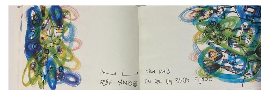
Figure 2. Distributed verses on the double-page set.

The content of the song points us towards the unknown. It invites us to think about what exists beyond what we see: "Tem carnaval muito além do cordão/Pra lá desse mundo, tem mais do que um rancho fundo/Tem mais fazer em saber porque faz/Tem mais querer em querer por demais" [There is carnival far beyond the rope/Beyond this world, there is more than a deep ranch/There is more to do in knowing why you do it/There is more to want in wanting too much] (Tati, Ozzetti & Derdyk, 2012 n.p). This suggestion of vagueness is in dialogue with the colour illustrations, which also show features that are not clearly defined. They merge, as seen in Figure 2, species of circles, and coloured spirals, which can point to the idea of turning movement. At times, the phrases themselves, overwritten, assume the function of illustration (Figure 3), suggesting that letters can act as images and that images can also be constructed by letters, thus breaking the limits between verbal language and visual.