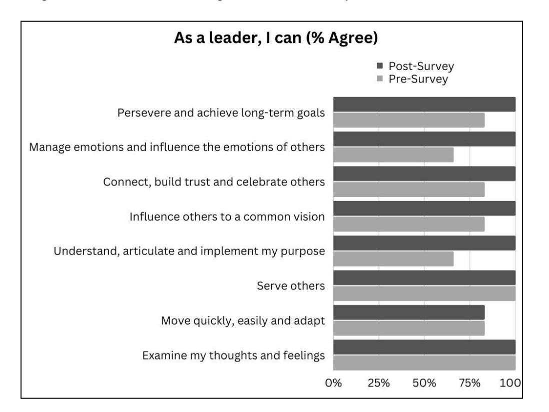
Graph 2: INSPIRED Leadership Framework Survey Results