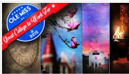
The University of Mississippi has again been recognized as one of the nation’s ‘Great Colleges to Work For’ by the Chronicle of Higher Education.

OXFORD, Miss. – Continuing to establish its reputation for employee satisfaction, the University of Mississippi has again been recognized as one of the nation’s “Great Colleges to Work For” by the Chronicle of Higher Education.