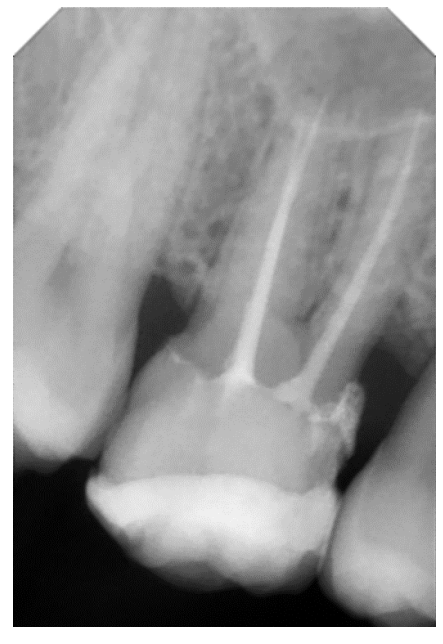
Fig. 9: Post-operative periapical radiograph of the tooth 16.

After this treatment, the patient was asked to return for a check 4 months later (Fig. 10) and for another one 12 months later (Fig. 11). The re-examinations showed that the tooth was asymptomatic. No tenderness to percussion was detected. The tooth was functional and the sulcus probing revealed normal values (1-3 mm). In addition, the radiographic examination showed adequate root canal filling and an adequate repair of the perforation site. Finally, no enlargement of the periodontal space was detected.