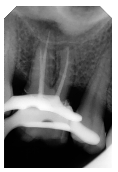
Fig. 8: Post-operative periapical radiograph showing the filled root canals and the BiodentineTM repair material placed over the furcation perforation.

The root canals were cleaned with 3.25% sodium hypochlorite and shaped in a crown-down technique, using rotary files (NiTi Rotate, VDW, Germany). Next, they were dried with paper points and filled using the lateral condensation technique (Fig. 7) (Fig. 8).