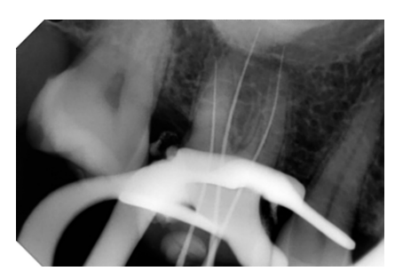
Fig. 6: Radiographic working length determination.

During the patient's second appointment, the temporary coronal temporary restoration was removed. The working length was determined radiographically (Fig. 6).