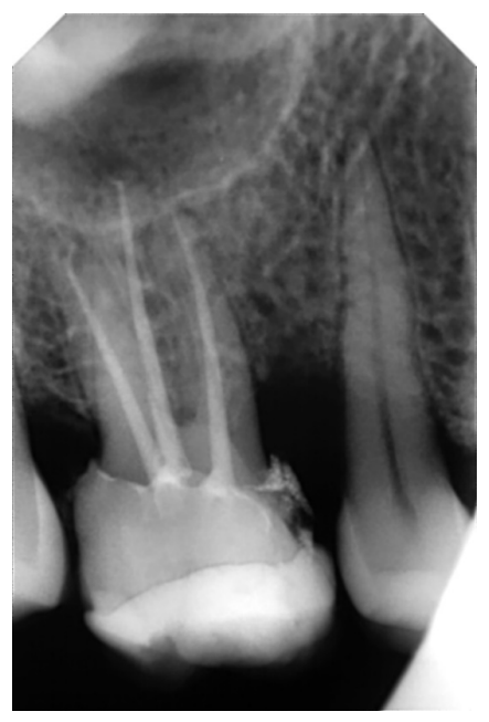
Fig. 10: Post-operative radiograph at 4 months follow-up.

After this treatment, the patient was asked to return for a check 4 months later (Fig. 10) and for another one 12 months later (Fig. 11). The re-examinations showed that the tooth was asymptomatic. No tenderness to percussion was detected. The tooth was functional and the sulcus probing revealed normal values (1-3 mm). In addition, the radiographic examination showed adequate root canal filling and an adequate repair of the perforation site. Finally, no enlargement of the periodontal space was detected.