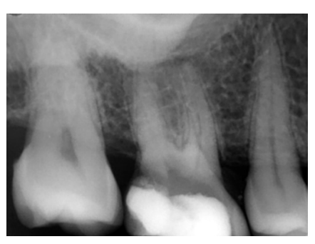
Fig. 1: Periapical radiograph showing the preoperative status of the tooth 16.

The preoperative periapical radiograph showed the presence of a temporary restorative material with a normal apparatus of the periodontal structures (Fig. 1).