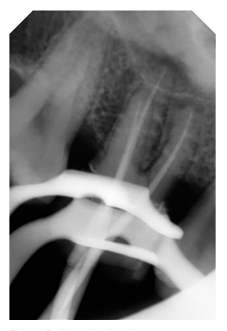
Fig. 7: Radiograph showing master cone verification after chemo-mechanical preparation of root canals.

The post-endodontic coronal restoration was performed using BiodentineTM followed by composite restoration (Fig. 9).