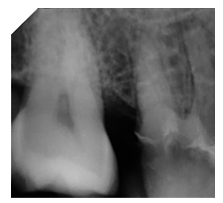
Fig. 5: Immediate radiographic image after perforation sealing using BiodentineTM.

After that, BiodentineTM was covered with CavitTM, a temporary restoration material (3M ESPE) (Fig. 5).