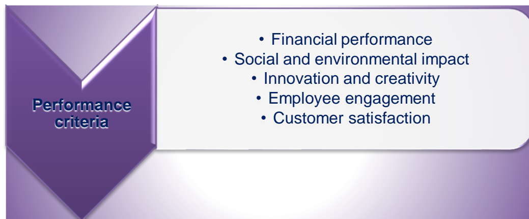
Fig. 2: Performance criteria the figure prepared by author of the study.

The author of the study has chosen three specific characteristics to measure the performance of organizations in relation to the current research issue. These variables are employee engagement, innovation and creativity, and social and environmental effect.