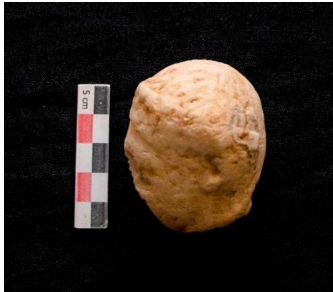
[FIGURE 4]: The left side of the face

As for the right side, only the upper part of the right ear and part of the tied diadem are visible [FIGURE 5]. It is worth noticing that the right side of the head is damaged in a way that suggests that this destruction was intentional. In other words, the facial features of the head were destroyed on purpose in order to eliminate the identity of the owner.