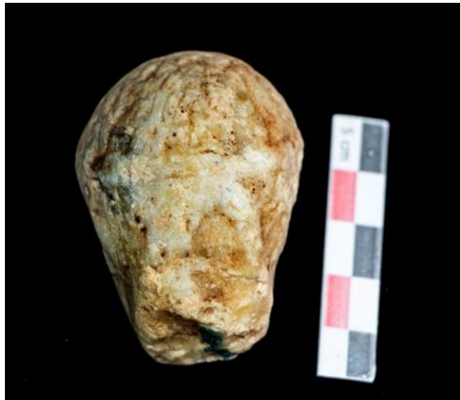
[FIGURE 6]: The knotted diadem at the back of the head