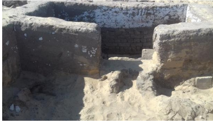
[FIGURE 2]: The small chapel inside of House N o .1 in Kom El-Louli