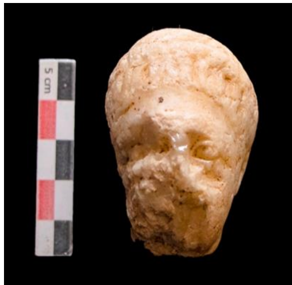
[FIGURE 3]: The small head from Kom El-Louli

The left eye is in good state of preservation, despite the small irregular shaped hole in the eye. The left eyebrow is almost unrecognizable due to the rough surface of the face, apparently caused by a hard object [FIGURE 3].