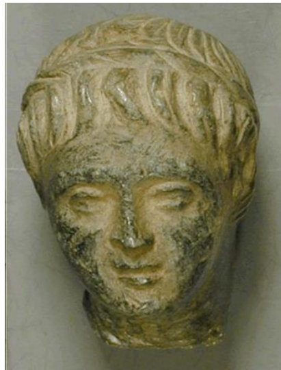
[FIGURE 9]: Greek-style portrait for prince Caesarion made of steatite.

The short hairstyle, as well as the twisted diadem, is also found in a black granite head in Bologna Museum [FIGURE 10]. This piece, dating from the 1st century BC, is also thought to represent Caesarion. Aside from minor damages of the diadem, the features are carefully stylized. His eyes are well carved, and the Egyptian uraeus is visible in front of the diadem. The hairstyle is similar to the head found in Kom el-Louli 23 .