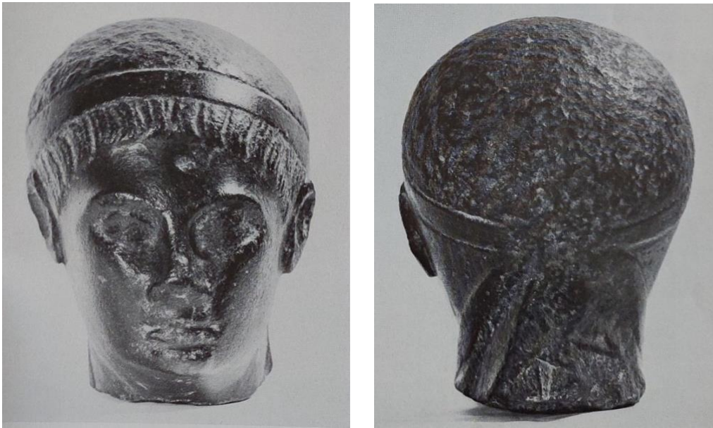
[FIGURE 11]: Portrait of Ptolemy XV Caesarion Greek-Egyptian.