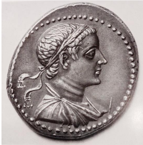
[FIGURE 8]: Portrait of Ptolemy V.

The slicked-forward hairstyle and the twisted diadem are two remarkable features that were strongly attested through other Ptolemaic royal portraits by the mid of 1st century BC. Such examples appeared as small heads, which have been discovered in large numbers in Alexandria and the Nile Delta and appeared to have been part of the cultic worship of the Ptolemaic royal ancestors 17 . It is possible that they were placed in shrines as votive offerings by private individuals or as figures in household altars 18 .