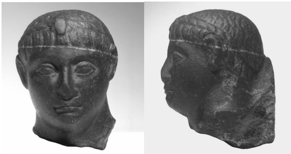
[FIGURE 10]: Portrait of Ptolemy XV Caesarion Greek-Egyptian, Inv.N o .KS 1803

The short hairstyle, as well as the twisted diadem, is also found in a black granite head in Bologna Museum [FIGURE 10]. This piece, dating from the 1st century BC, is also thought to represent Caesarion. Aside from minor damages of the diadem, the features are carefully stylized. His eyes are well carved, and the Egyptian uraeus is visible in front of the diadem. The hairstyle is similar to the head found in Kom el-Louli 23 .