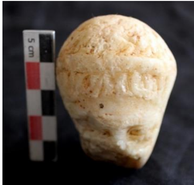
[FIGURE 7]: The diadem and hairstyle

The hair consists of fringes that hang over the forehead, which is also a style that appears in large sculptures 7 . However, the appearance of short fringes of hair under the headdress appeared as early as the second century BC, especially in Egyptianizing portraits. During this era, portraits of Ptolemaic kings such as Ptolemy V and Ptolemy VI bore similar hairstyles accompanied by the Egyptian royal Nemes headdress 8 . In official portraits, the headdress was a significant symbol to convey the idea of supreme power enjoyed by a single individual, as it is a symbol of royal status.