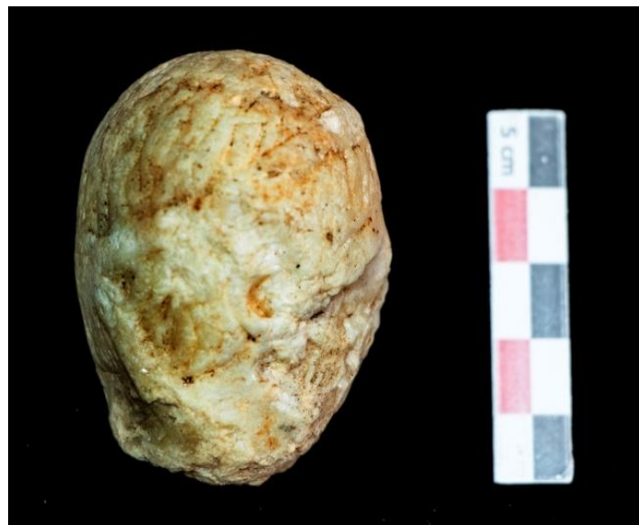
[FIGURE 5]: The right side of the face

As for the right side, only the upper part of the right ear and part of the tied diadem are visible [FIGURE 5]. It is worth noticing that the right side of the head is damaged in a way that suggests that this destruction was intentional. In other words, the facial features of the head were destroyed on purpose in order to eliminate the identity of the owner.