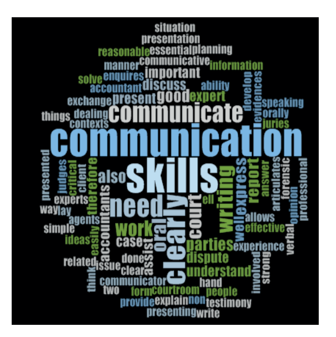
Fig. 1: Frequently Occurring Words in Interviews