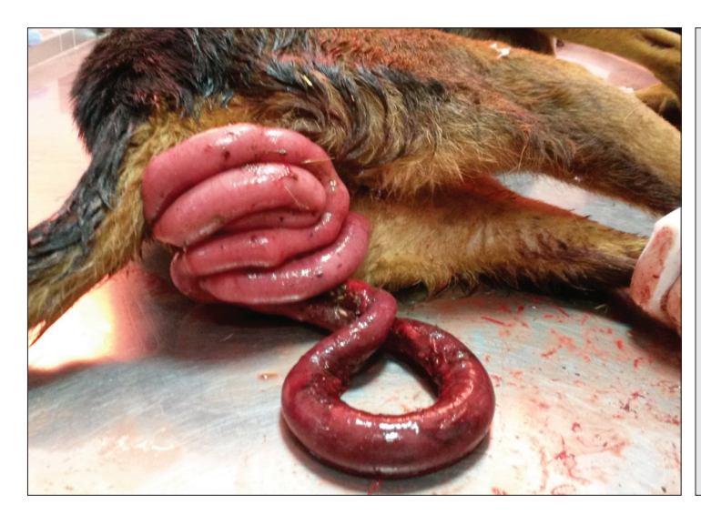
\textbf{Fig 1.} \ Macroscopic \ appearance \ of \ transvaginal \ bowel \ evisceration

immediately. While under general anaesthesia with 7 mg/ kg propofol (Propofol, Abbot®, Turkey) and 2% isoflurane (Isoflurane®, Adeka, Turkey) the intestinal loops were reduced via carefully intra-abdominal traction. The affected portion of the intestines was resected and a bowel anastomosis was performed using 2-0 Polyglactin 910 (Vicryl®, Ethicon, UK) thread with Schimiden and Lembert sutures as shown Fig. 3. Moreover, the vaginal tear, the cause of this evisceration was detected on the left side of vagina (9 centimetres from cervix) and it was repaired with 2-0 Polyglactin 910 (Vicryl®, Ethicon, UK) thread with simple continuous sutures (Fig. 4). The abdominal cavity was flashed with warm 0.9% saline solution and intestines were repositioned in carefully. According to owner's request, the patient was spayed with ovariohysterectomy before abdominal closure. Postoperatively, cephalosporin (Sefazol®, Mustafa Nevzat, Turkey) was given for 7 days (30 mg/kg, IM) every 12 h. Also, first four days was prescribed only fluid therapy by IV. Throughout four days was used every 12 h 50 ml of 5% dextrose, lactated Ringer 75 ml, 0.9% NaCl 250 ml, and Metronidazole (Flagyl®, Eczacıbaşı, Turkey) (25 mg/kg). Next seven days was given water and diluted canine A/D