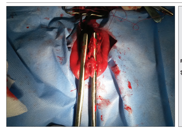
Fig 3. Termino-terminal anastomosis procedure Şekil 3. Uçuca anostomoz uygulaması