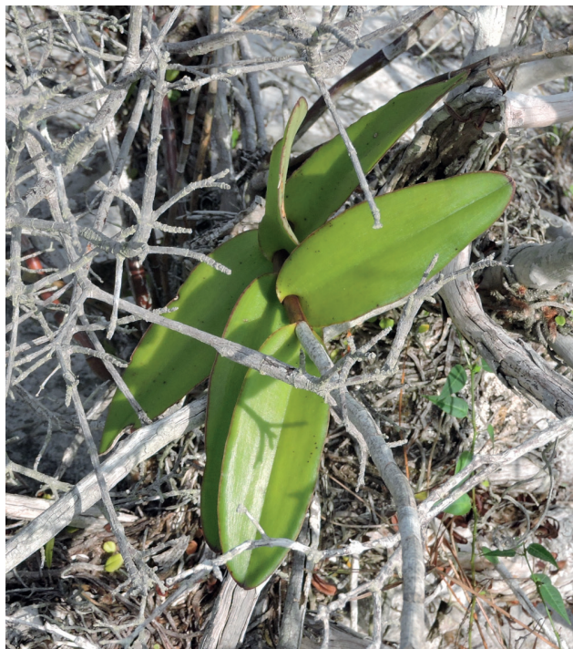
Figure 2. Individual of Epidendrum cinnabarinum Salzm. in Área de Proteção Ambiental das Lagoas e Dunas do Abaeté, Bahia, Brazil, showing the typical totally green foliage of the species.

lack of a relevant variegated phenotype in wild populations (Marcotrigiano 1997). All of these characteristics could be observed or related to the present case. The hypothesis of virus infection is ruled out since viruses in orchids often promote asymptomatic infections; when infections are symptomatic, they are mainly expressed by leaves with chlorotic or necrotic spots, which may be depressed or not and are irregularly distributed (Kubo et al. 2009; Kitajima et al. 2010; Moraes et al. 2017). In any event, infected plants do not display distinct cream or yellow and longitudinal stripes on the leaves.