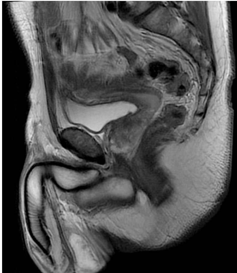
Figure 2. MRI confirmed the presence of a solid formation, located above the bladder, similar to a rudimentary uterus.

Testicular echo-color-doppler was performed, confirming the mild bilateral testicular atrophy detected on physical examination, but no lesions suggestive of malignancy. The karyotype analysis showed a male karyotype 46XY. Based on the intraoperative findings, history of bilateral cryptorchidism, MRI imaging and karyotype, diagnosis of PMDS was made. The patient was counseled about the rare risk of neoplastic transformation of the residual Müller ducts and was offered surgical treatment to remove these structures, which he declined. The subsequent imaging follow-up with testicular and pelvic ultrasound were negative for malignant testicular and Müllerian derivative degeneration.