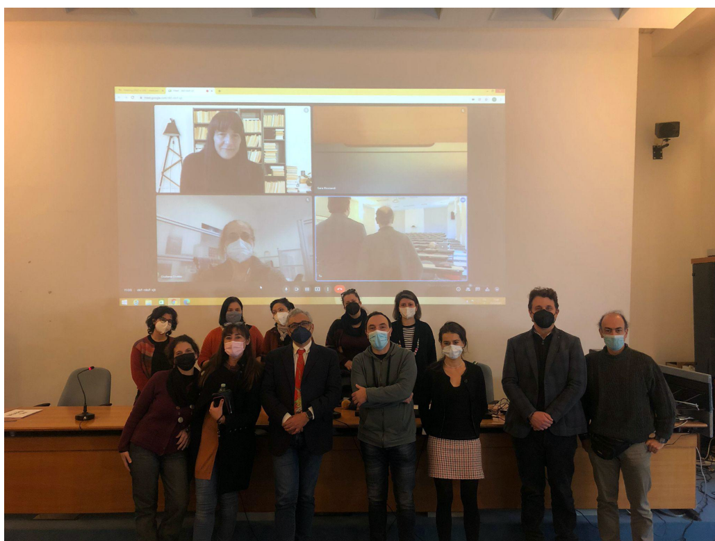
First in-presence meeting at Rome, 15 December 2021