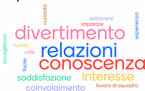
Figure 6: Word clouds obtained by asking the high-school students who delivered the workshops during the Festival. Top panel: word cloud obtained before the training “From this experience I expect...”. The most repeated words are “knowledge”, “interest”, and “learn”. Bottom panel: word cloud obtained at the end of the Festival “From this experience I have obtained...”. The most repeated words are “relationships”, “knowledge”, “fun”.

Festival achieved the goal to transmit astronomical contents, but it also helped to create a network between peers, a fundamental achievement in that age range and in this historical period (Figure 6).