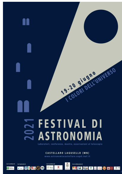
Figure 4: Poster used to advertise the Festival. The graphical project is by Francesca Zanella.

The Festival has also been the occasion to engage the local population and spread the astronomical culture in a rural area. The inhabitants participated not only as spectators to the Festival, but were also active players by opening private courtyards, usually inaccessible to the public, and setting them up to host the proposed activities. This created an atmosphere of empathy and support between the local population, the astronomers, and the students leading the hands-on workshops. This also allowed the locals to value the beauty of their territory, their historical and naturalistic sites, and to promote them among visitors coming from other cities.