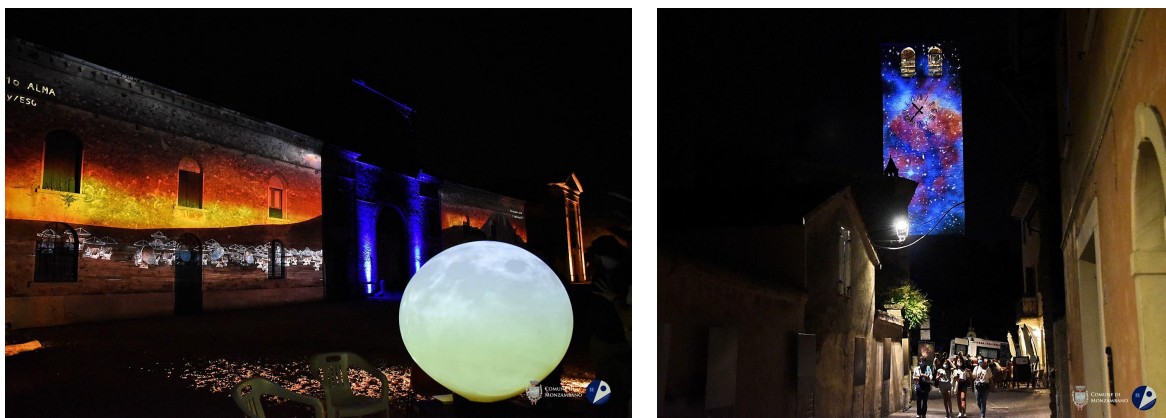
Figure 3: Wall mapping projections. Left panel: facade of Villa Arrighi. Right panel: the bell tower of Castellaro Lagusello.