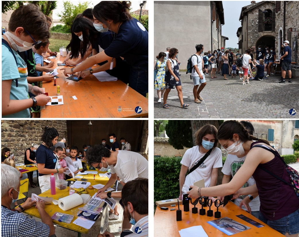
Figure 1: Pictures taken during the hands-on workshops. Top left panel: workshop “Are colors always the same?”. Top right panel: workshop “Radio-treasure hunt”. Bottom left panel: workshop “Radioactive bananas and cosmic rays”. Bottom right panel: workshop “Catching starlight”.