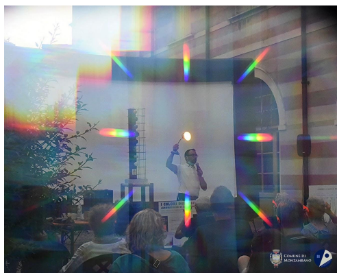
Figure 2: Picture taken during the conference “Colors of the stars: a spectroscopic workshop”. The picture was taken by a spectator through a grating that was provided to the public by the speaker, Paolo Ochner, to see the spectra of various lamps.