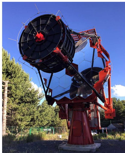
Fig. 1. ASTRI-Horn dual-mirror Cherenkov telescope installed on Mt. Etna (Italy) at the INAF M.C. Fracastoro observing station.

The verification and scientific validation of any ground-based gamma-ray instrument are typically performed by observing well-known and bright gamma-ray sources. In the case of the ASTRI-Horn telescope, the Crab Nebula, the remnants of a