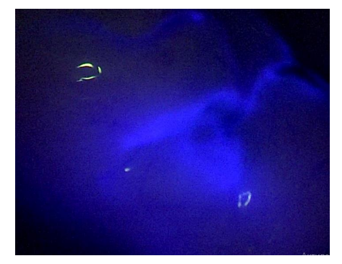
Fig. 3. The stained sentinel lymph node in the fluorescence mode on the "Karl Storz" stand