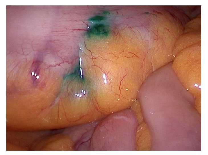
Fig. 2. Stained sentinel lymph nodes during laparoscopy

In all the patients of this group after performing local excision of tumors using the TEM technique with taking into account a high risk of recurrence and metastasis, the standard TEM technique was added with an express histological examination of the sentinel lymph node. The patient's treatment was started according to the standard TEM method, then 1-2 ml of ICG dye was injected into the submucosal layer of the tumor. In 15 minutes after staining laparoscopy was performed to dissect the stained regional lymph nodes (Fig. 2).