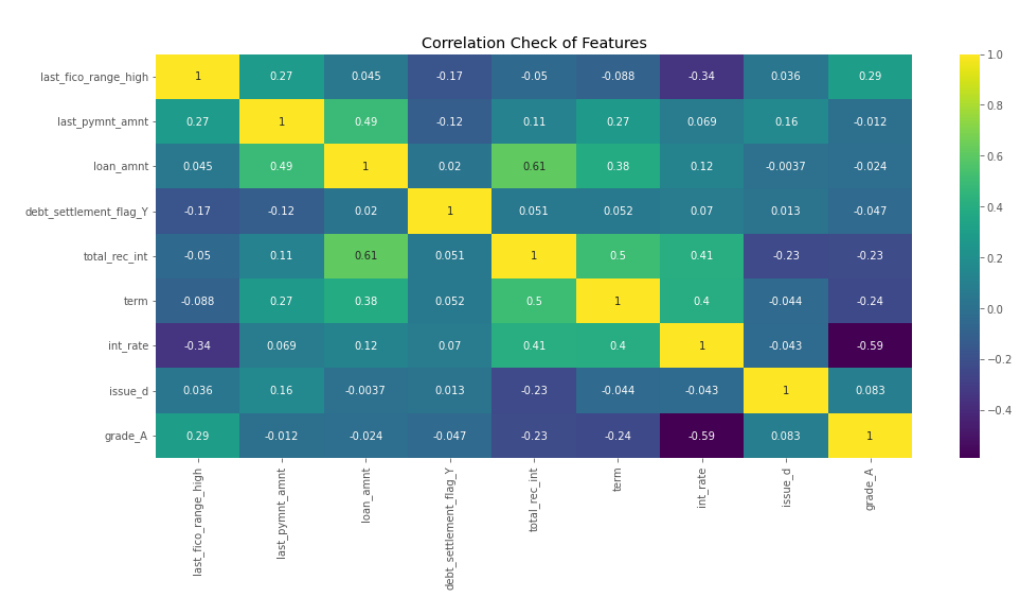
Figure 1. Correlation matrix for selected features.

Figure 1. displays the Pearson correlation matrix for the selected features. In Table 2., we present the descriptive statistics.