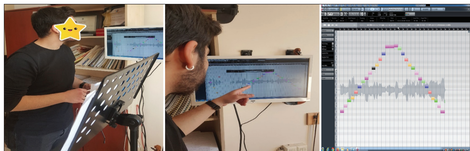
Figure 3. Photos of the implementation process

scores of the students receiving violin education with computer-based visual feedback?” which is the second research question of the study are given in Table 4.