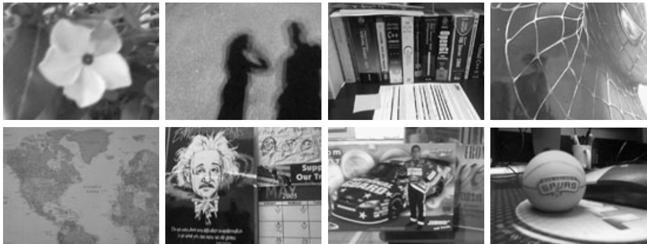
Figure 1: Sample set of images from the set used to detect Nokia clean images from Nokia stego images.

The image set taken with the Nokia 6620 camera phone were mid-quality 640x480 Symbian JPEG images. For testing purposes the image data set consisted of 100 clean images, 100 images with 3% stego modification and 100 images with 8% stego modification. The image data is embedded using a simple DCT coefficient method with an embedding rate percentage based on the image size. The embedding technique is a modification of algorithm discussed in [2].