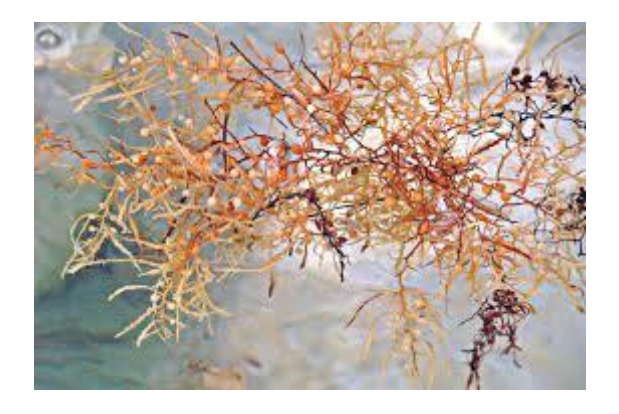
Figure 1: Diagram represent the Brown algae