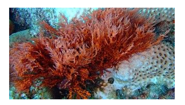
Figure 2: Diagram represent the Red algae