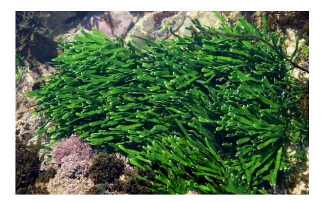
Figure 3: Diagram represent the Green algae

Figure 2: Diagram represent the Red algae