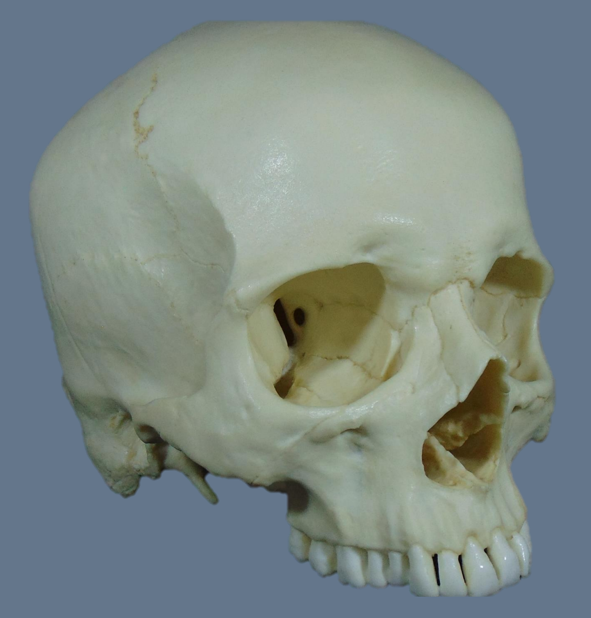
Fig. 1 Photogrammetric Model: Adult Male Crania (Resin Cast)

Of the competing methods for the estimation of the number of individuals represented within a skeletal assemblage, variations of the calculation of MNI (Minimum Number of Individuals) are most often employed. This presentation provides the preliminary results of an exhaustive study designed to determine the minimum number of individuals represented within a collection of 1,065 skeletal elements and fragments, belonging to the Eastern Washington University Anthropology Program. Results produced by established methods of computation were reinterpreted to account for the introduction of Procurement Bias in the calculation of MNI.