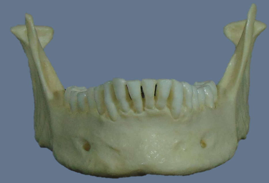
Fig. 3 Photogrammetric Model: Adult Male Mandible (Resin Cast)

Unless the body is articulated – such as in the case of 'standing skeletons' – it is unlikely that the remains of a single individual will be purchased in their entirety. This potentially has drastic implications for the calculation of MNI for skeletal collections. As previously stated, the highest count produced during the current phase of research is 21. However, it is probable that the true count greatly exceeds this figure. Via visual reassociation and osteometric pair matching, 46 of the 180 skeletal elements were found to be in association with at least one other element in the subset, eliminating 26 false "individuals" which would have otherwise been erroneously counted. Assuming each unassociated element represents a unique individual, 154 people may be represented within the subset alone. This count is a \approx 633\% increase from the original estimate. If this pattern is representative of the remainder of the collection, the number of individuals represented within the assemblage could enter well into the hundreds.