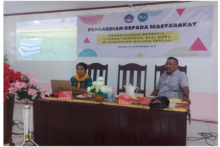
Figure 2. Presentation of learning materials based on numeracy literacy

Numeracy literacy-based learning allows students to engage with real problems in various contexts to consolidate and expand their numeracy skills. Thus, numeracy literacy will result in understanding mathematical terminology and numerical and spatial information communicated in tables, graphs, diagrams, and text. Numerical literacy will develop the use of basic mathematical skills in analyzing critical situations and creatively solving everyday problems.