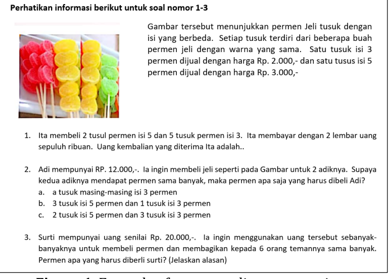
Figure 1. Example of numeracy literacy questions

Implementing numeracy literacy in learning cannot separate students' efforts in creating models, media, and learning methods. One of them is learning to read because it plays an essential role in life and increases knowledge. The basic principle of numeracy literacy is contextual. Thus the questions given to students aim to explore things related to students' daily lives through story questions. An example is presented when providing training as follows.