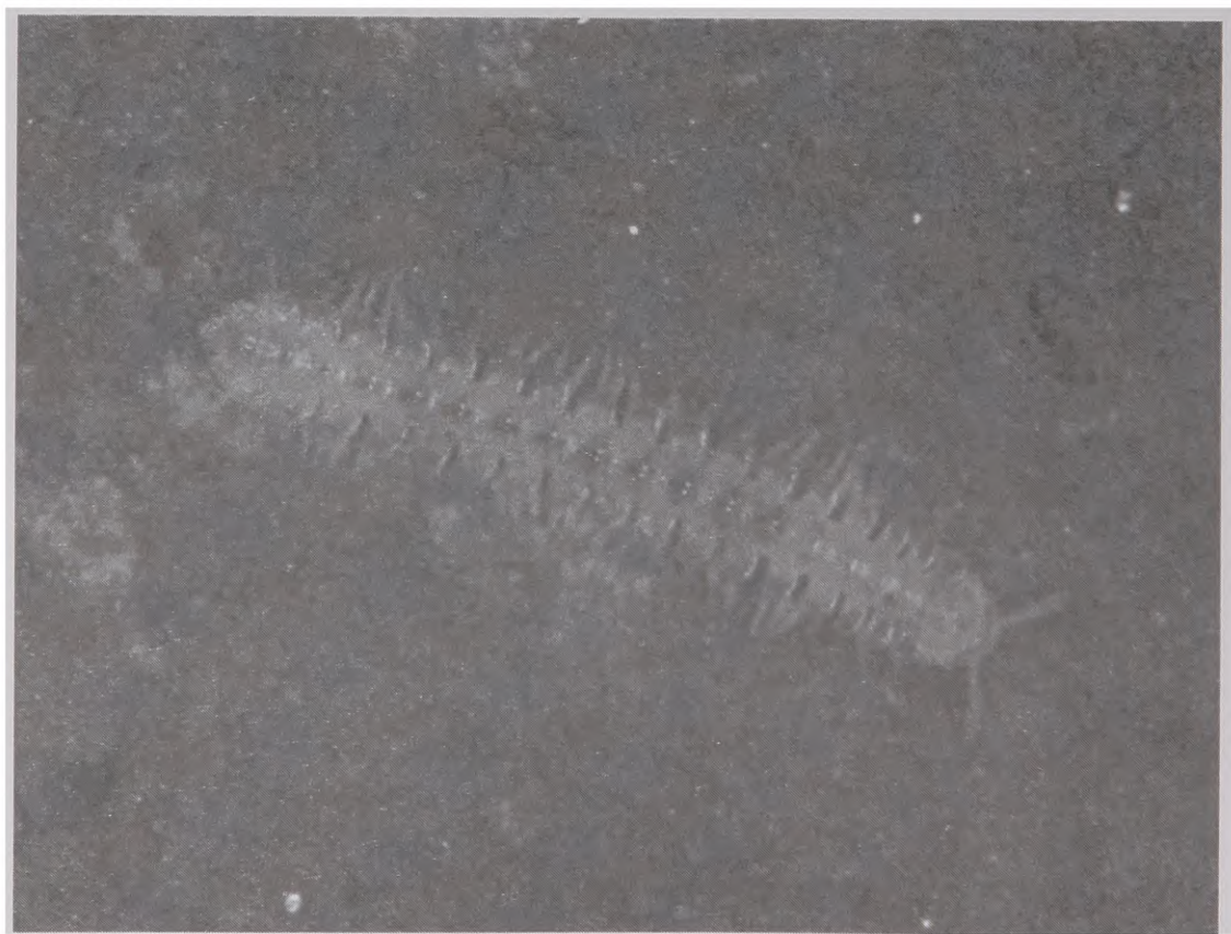
Figure 4. Peridontodesmella alba (Cryptodesmidae) from Paiva Cave, Iporanga, SP.