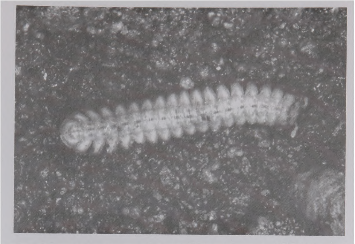
Figure 5. Crypturodesmus sp. (Oniscodesmidae) from São Miguel Cave, MS.

areas such as the Vale do Ribeira, Serra da Bodoquena and most Bambuí area, points to a few dominant groups, namely the widespread troglophilic Pseudonannolenne species and troglophilic and troglobitic polydesmidans, mainly Chelodesmidae, Oniscodesmidae and Cryptodesmidae, besides some less common taxa such as spirostreptids, pyrgodesmids and paradoxomatids. The composition of cave millipede communities results from differential “selection” of components of epigean communities living in karst areas both in the present and in the past, in accordance with their degree of preadaptation to subterranean life.