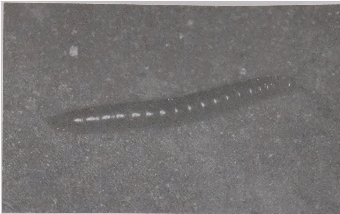
Figure 3. Catharosoma sp. (Paradoxosomatidae) from Colorida Cave, Iporanga, SP.