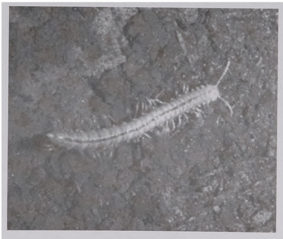
Figure 2. Leodesmus yporangae (Chelodesmidae) from Areias de Cima Cave, Iporanga, SP.