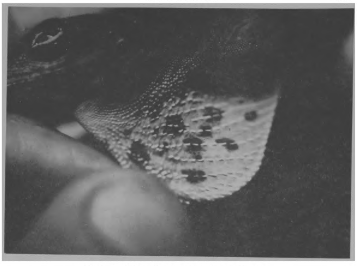
Figure 1. Anolis philopunctatus & , MSUSP 65856.