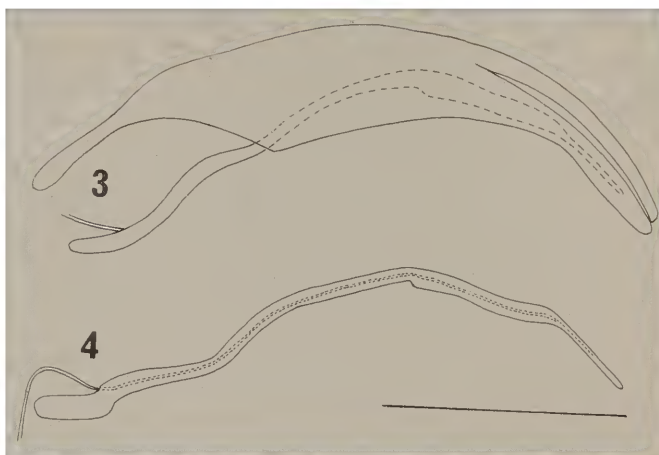
Figs. 3, 4. Genitalia of Lepicerus inaequalis Motschulsky, 1855 (adapted from Sharp & Muir, 1912, fig. 123).

The Venezuelan record must be taken with certain care, since I was unable to locate the specimen(s) in the Paris Museum in 1971, and it is possible, even though not probable, that another species occurs in Venezuela.