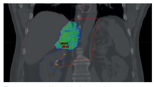
Figure 1. A 56-year-old man with adrenocortical carcinoma status post adrenalectomy and post tumor recurrence surgical resection. Postoperative radiation therapy during mitotane chemotherapy to decrease the risk of total recurrence. The planned target volume (PTV) of the elective lymph node group is in red. The PTV of the tumor bed with dose distribution is colored