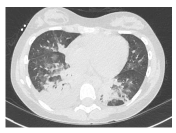
Figure 1 – CT of the chest showing bibasilar patchy ground glass opacities, a right lower lobe consolidation, and a right pleural effusion. The patchy lower-lobe ground glass appearance is typical of coronavirus disease 2019 seen in adults.

Adult medication dosing was used because she weighed 59 kg. Treatment began with hydroxychloroquine 400 mg twice daily and azithromycin 250 mg twice daily, as was common practice at that time. On intubation, she had features suggestive of macrophage activation-like syndrome (MALS) or secondary hemophagocytic lymphohistiocytosis with fever, splenomegaly, high ferritin, and elevated soluble IL-2 receptor. Anakinra 100 mg q6h and dexamethasone 10 mg/m² daily were started per secondary hemophagocytic lymphohistiocytosis institutional standards. Her C-reactive protein and ferritin decreased significantly (Fig 2). A 7-day course of remdesivir, an experimental antiviral, was given through compassionate use protocol.