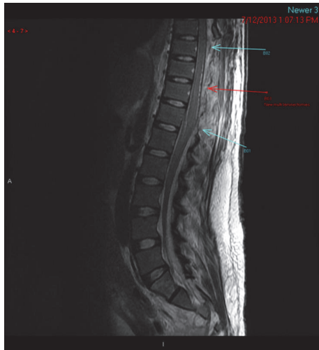
FIGURE 2: Image of SEA posttreatment.

pregnant patient populations, and high suspicion for this risk factor is important [7, 8].