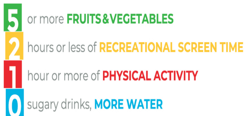
Fig. 2. 5-2-1-0 Healthy Habits Message.

sugary drinks and more water intake (Fig. 2). Though this message has been found to increase awareness and healthy behaviors, it remains to be seen if that will translate to concrete behavioral changes.