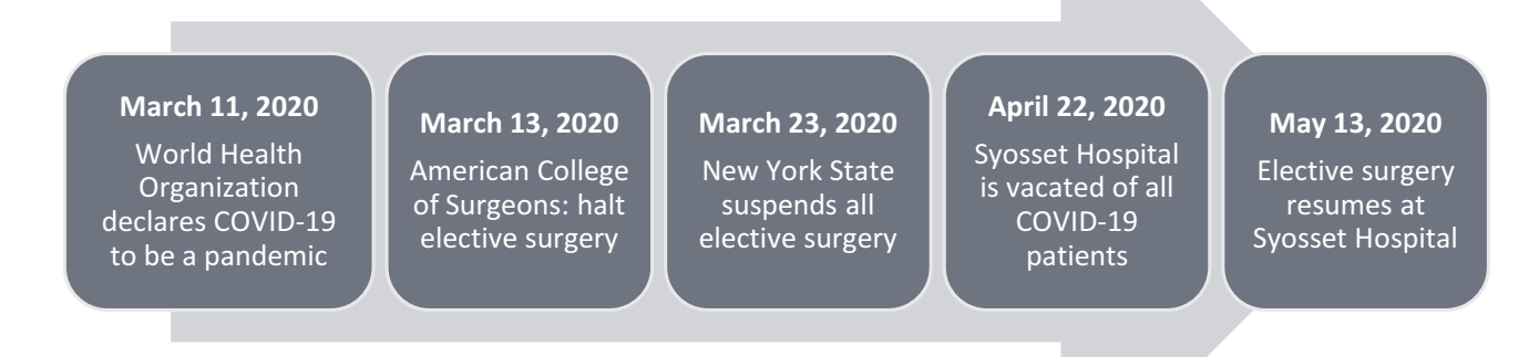
Figure 1 Timeline of events in New York State as epicenter of COVID-19 in the US.

The multifactorial, multidisciplinary process of resuming elective surgery begins here (Figure 2). Once the hospital was emptied, a complete and thorough cleaning and disinfection was performed on the entire building. All equipment was thoroughly decontaminated following Centers for Disease Control and Prevention (CDC) guidelines.<sup>13,14</sup>